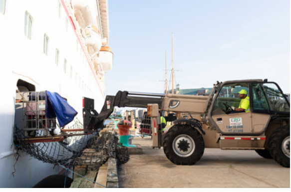
CP&O baggage bandling at the Half Moon Cruise Terminal

"At CP&O we're a very tight-knit group," he explained. "We all have a long history of working together. Each day I come into work, I look forward to our comradery, seeing smiling faces and hearing family stories. Our motto around here – 'we are family' – reflects that."•